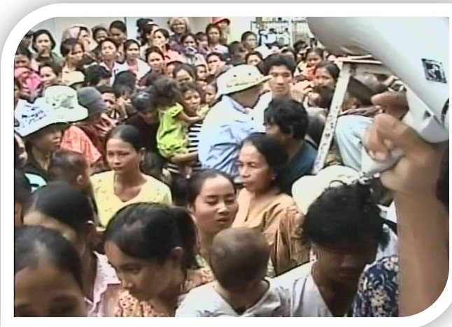
In the Remote area of the country where people/patients are lining up to receive a long overdue Healthcare need (Above).