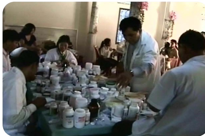
Prescription Medication are being filled and delivered to the needed patients (Above).