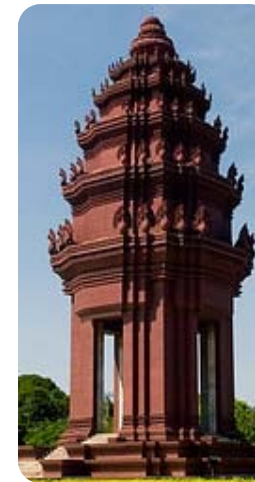
Cambodian symbol of Independence (left)